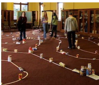
Food Labyrinth at Marylhurst World Labyrinth Day

http://labyrinthnetworknorthwest.org/forms/110626_NWRLG.php