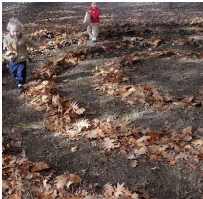
Leaf Labyrinth