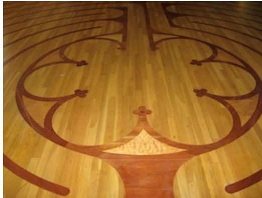
Trinity Cathedral Labyrinth, Portland, OR