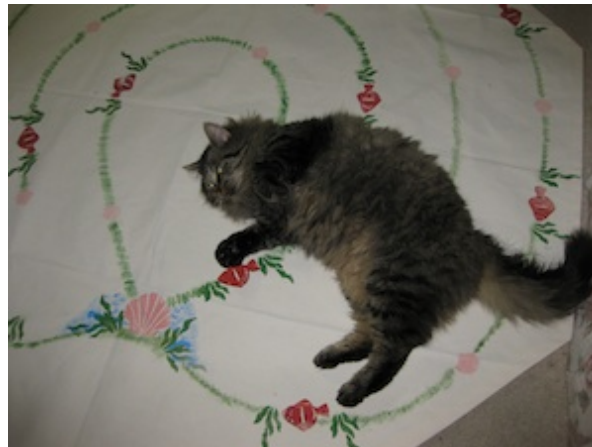
Charley - Star of Facebook