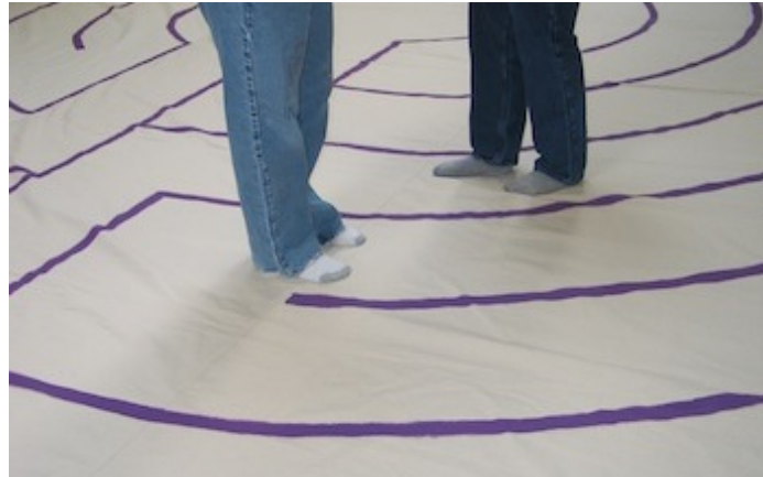
Inmates walking the labyrinth Coffee Creek Correctional Facility Wilsonville, Oregon