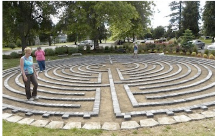
Labyrinth at Shalom Prayer Center, Mt. Angel, OR