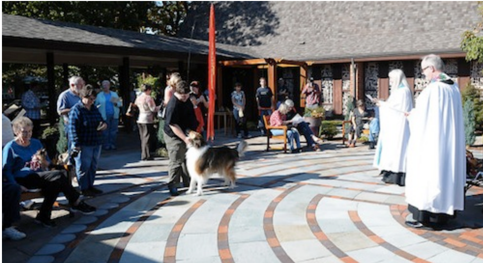
St. Francis Day Blessing of the Animals - on the new labyrinth Church of the Good Samaritan, Corvallis, OR