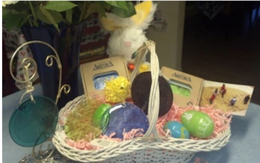
Labyrinth Suncatchers available in a variety of colors

http://labyrinthnetworknorthwest.org/forms/LNN_store.php