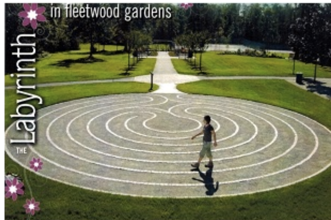
Labyrinth in Fleetwood Gardens Surrey, British Columbia, Canada