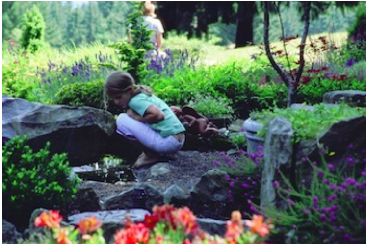
Pool in the Center of the labyrinth Kinnie Garden Labyrinth LNN Pilgrimage -July 2008