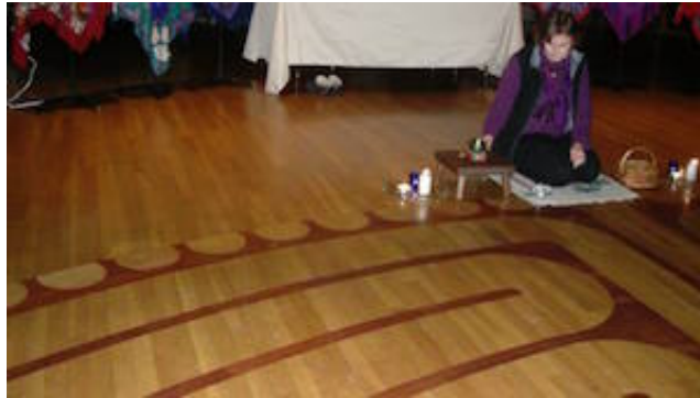
Icon Walk 2013 - Trinity Cathedral, Portland, OR

Advent Labyrinth Walk with Icons Trinity Episcopal Cathedral, Portland Tonight, December, 7, 2015