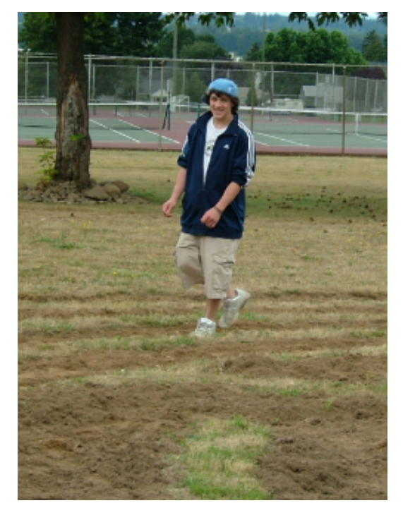
The public is welcome to come and walk the labyrinth which is located near Northeast 115th Avenue and Shaver Street.