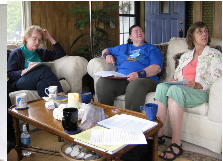
LNN Planning Circle - First Annual Retreat Neskowin, Oregon - May 29-30, 2009