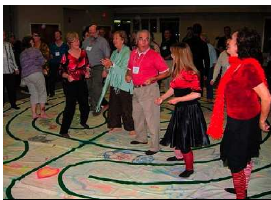
TLS 10th Birthday Celebration Atlanta, Georgia