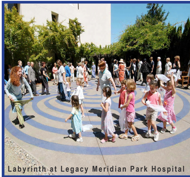
Labyrinth at Legacy Meridian Park Hospital

Community Health Education Center Legacy Meridian Park Hospital 19300 SW 65th Avenue Tualatin, OR 97062