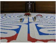
Canvas Chartres Labyrinth