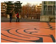
Seattle Center Labyrinth