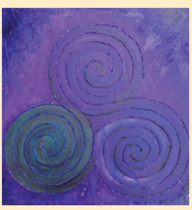
Photo Credits: The Imprint Labyrinth of Gloucester, by the Webecoist

is relatively easy, though keeping what you change might be more consuming. Each day take notice of the changes you make from step to step or day to day and find an outlet like journaling, painting, music or other creative endeavors to record your growth in change this month.