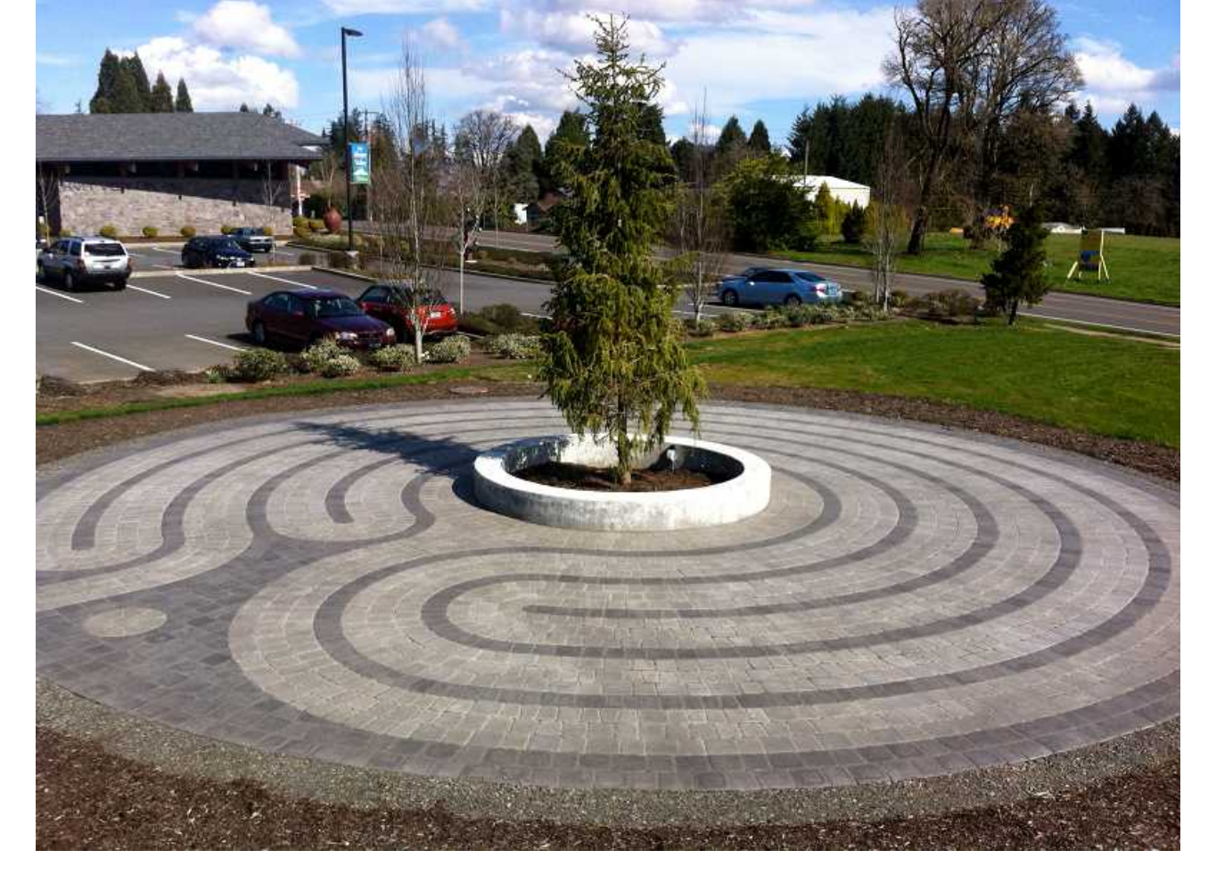
CONTRIBUTED PHOTO - Shibley designed this labyrinth under construction outside the Happy Valley City Hall.

The Estacada-based landscape architect and contractor is used to "big picture" projects.