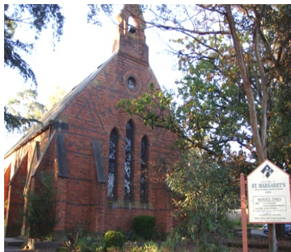
St. Margaret's Uniting Church, Eltham

It started with one person's quest: to share a labyrinth gathering with like minded people who are creating and working with labyrinths within communities and hospitals to come together and share their unique experiences of all things labyrinthine.